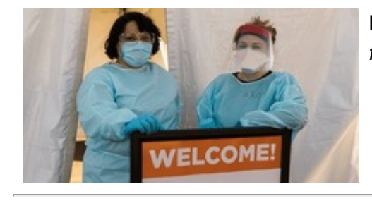
Need to get tested for COVID-19? You can find out how by clicking on the image.

For More Information: kingcounty.gov/vaccine