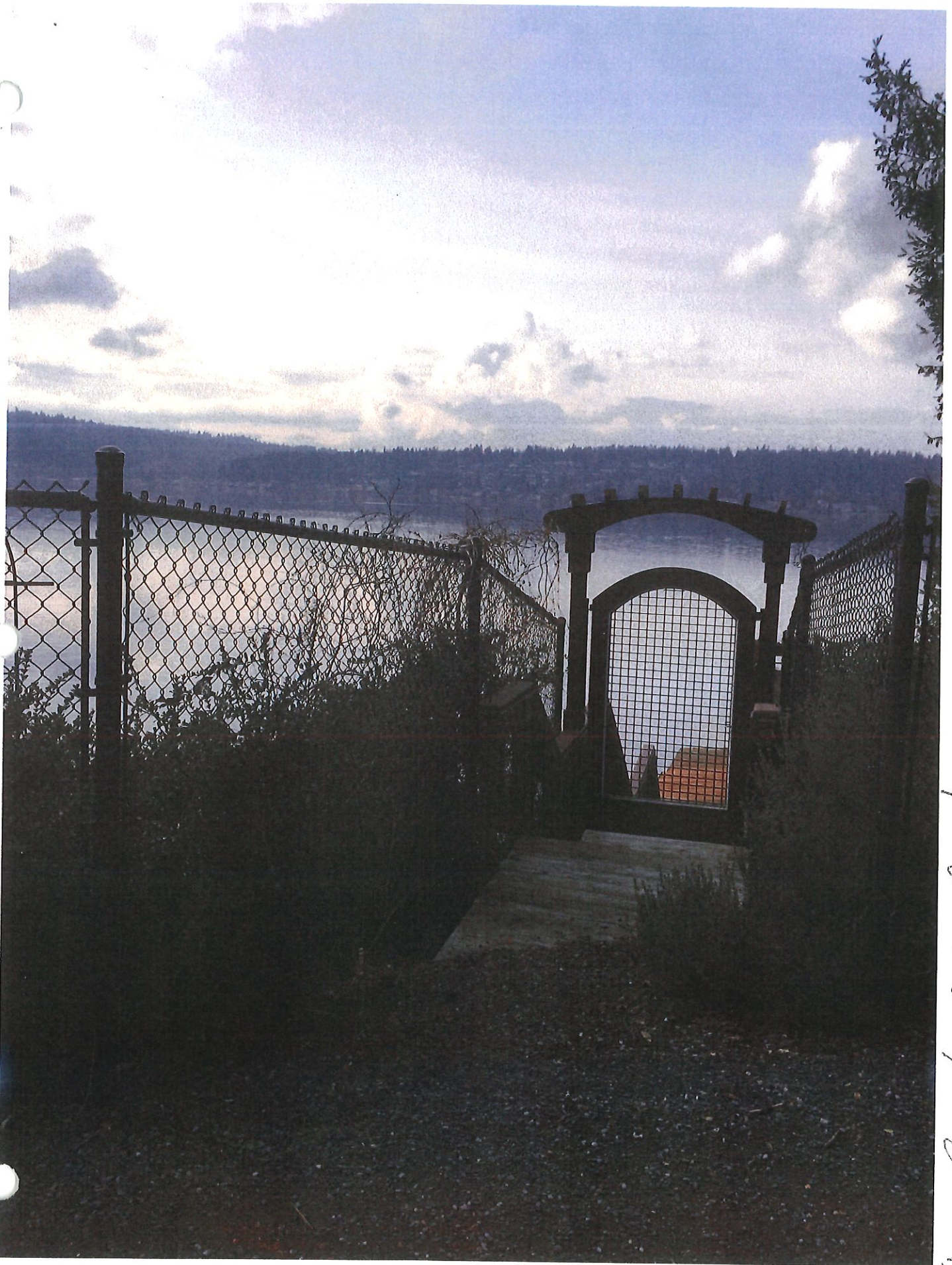
Current Beres dock fencing by