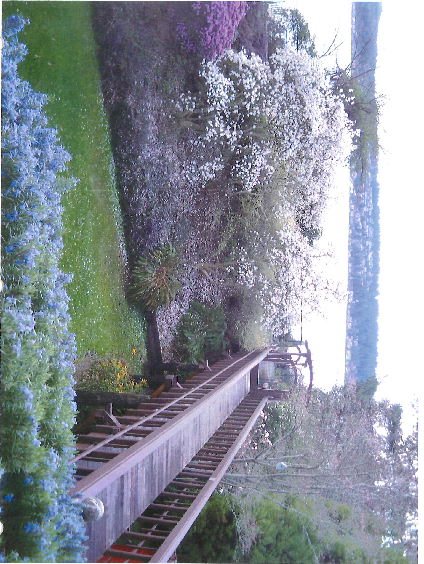
Buses Bridge to dock