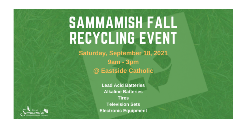
The Fall Recycling Event for Sammamish Residents will take place tomorrow.

The Sammamish Pop Up Labyrinth at the Commons Plaza in City Hall will have another guided walk, "Hollow Bone", on Saturday, September 18 from 10am-12pm. Guided walks introduce the history of labyrinths and offer approaches for walking. You'll walk the labyrinth in the company of others and see how it works for you. Please note that the schedule may be subject to change. Check the webpage before any event by clicking on the image!