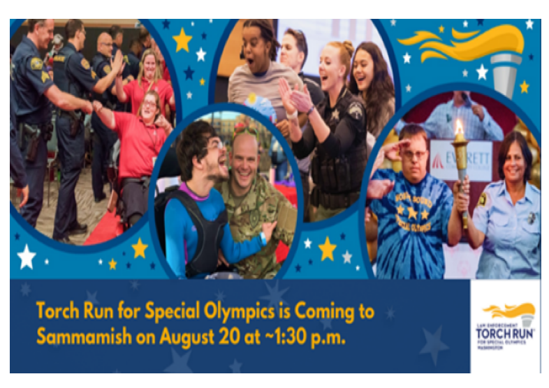
The Special Olympics Torch will make its way through Sammamish on August

Congratulations to our Washington State Champions <u>Eastlake Little League</u>, who last night defeated Montana 10 - 4 to advance to the Little League World Series in Williamsport, PA. They will play again on Saturday at 5:00 pm to determine if they are Seed A or B at the World Series. Sammamish is so proud of you!