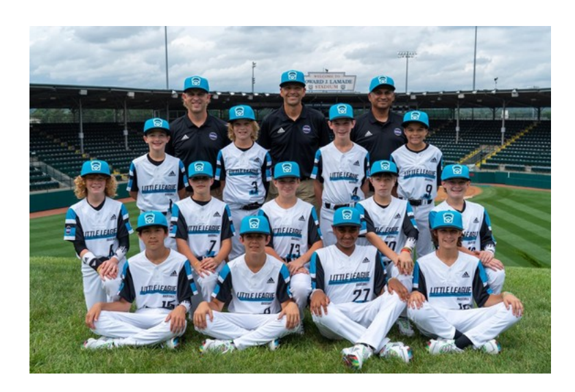
Eastlake Little League's first World Series game is today, Friday August 20 at 4pm PST on ESPN2. Let's cheer them on! Click on the image to find out how you can follow their journey at the Little League World Series!